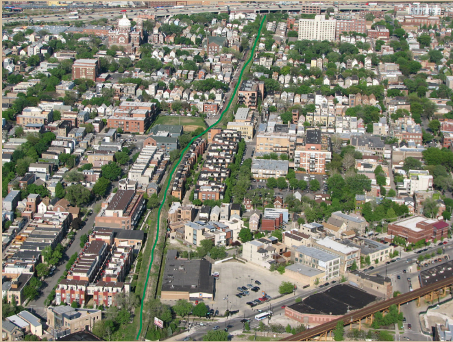
Trust for Public Land